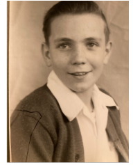
6 th Grade